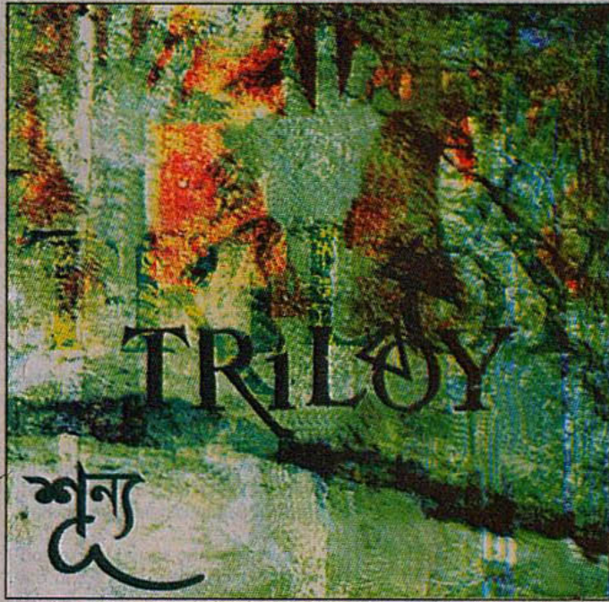
Cover jacket of the album

beginning to another good sounding track. The keyboard applications and guitar works were appreciable. The lyric here reflected very contemporary issue of the early twenties, phase of the