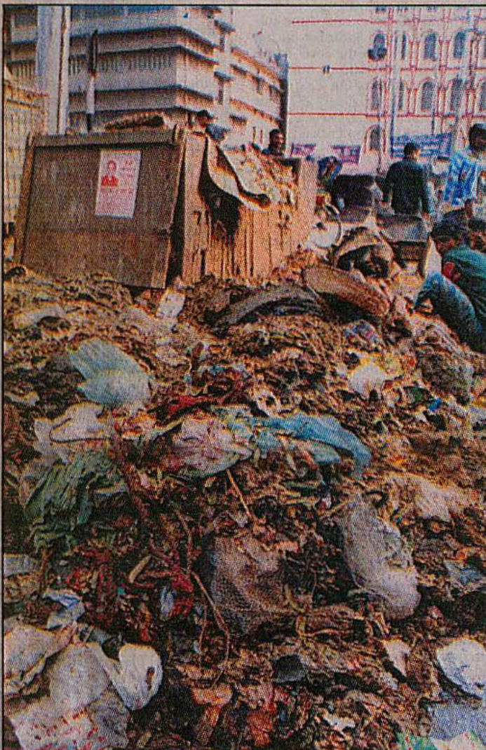
Garbage litters this road at Bangshal in the capital yesterday, two days after the Eid-ul-Azha, despite Dhaka City Corporation's efforts to clean all garbage by the Eid day.