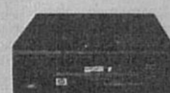
HP STORAGEWORKS ULTRIUM 1/8 AUTOLOADER