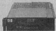
HP STORAGEWORKS DAT72

The benefits never end. Right from the popular industry-standard Digital Data Storage (DDS) technology of the HP StorageWorks DAT72. To the HP StorageWorks Ultrium 215's simple and robust design based on inherently reliable LTO* technology. To the HP StorageWorks 1/8 Tape Autoloader's affordability - comparable only with standalone drives. Yes, across the range of HP StorageWorks, you will discover high capacity, reliability, rack optimization, efficiency, compatibility and investment protection only expected of HP. The StorageWorks range. Reliability that counts.