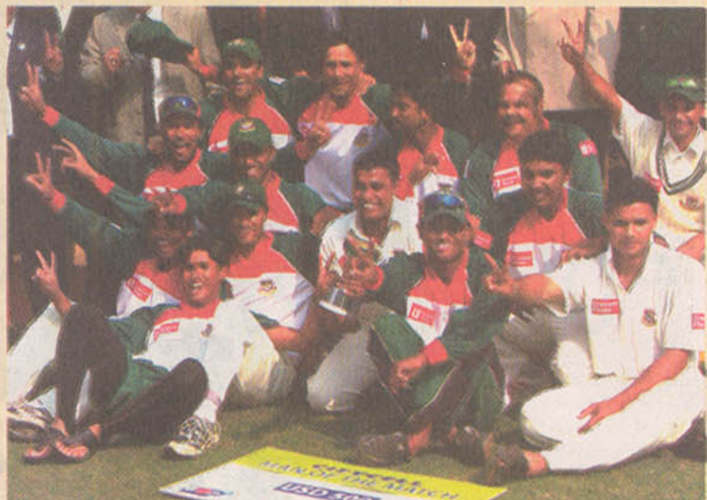
The long eluding victory finally dawns.