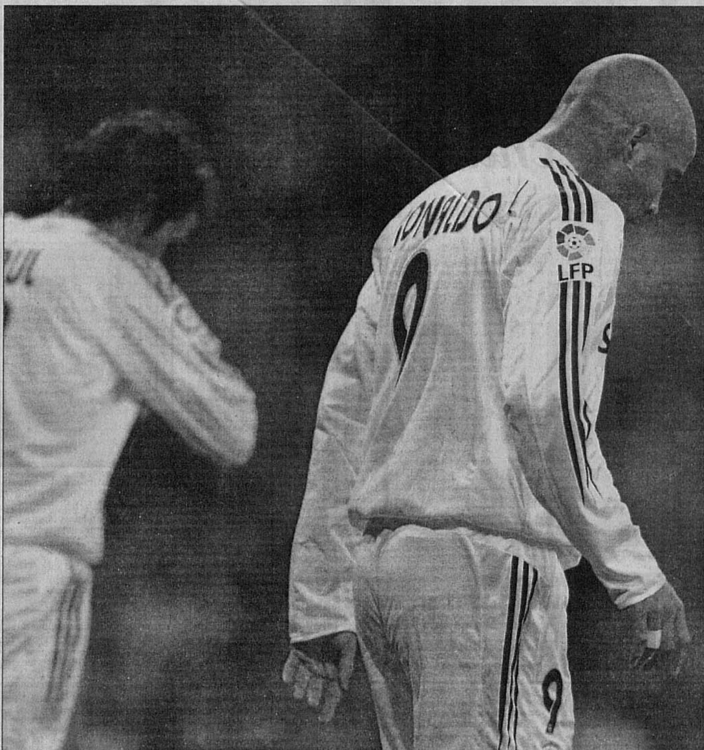
PICTURE TELLS THE STORY: Real Madrid superstars Ronaldo (R) and Raul leaving the field dejectedly after their King's Cup third round exit at the Santiago Bernabeu Stadium in Madrid on January 19.