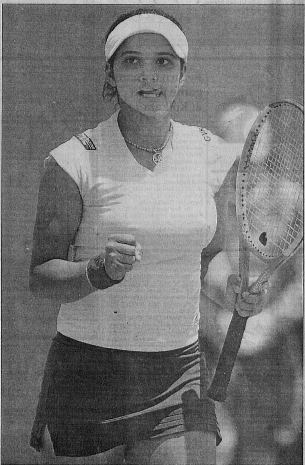
SANIA MIRZA... first Indian woman to reach the third round of a Grand Slam.

WEST INDIES (likely): Brian Lara (captain), Chris Gayle, Wavell Hinds, Ramnaresh Sarwan, Shivnarine Chanderpaul, Marlon Samuels, Dwayne Bravo, Courtney Browne, Ian Bradshaw, Mervyn Dillon, Pedro Collins, Xavier Marshall (12th man).