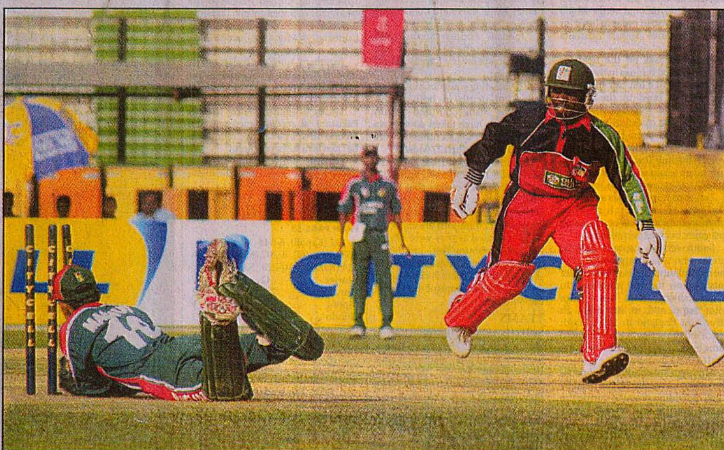
THE BIG ONE! Bangladesh wicketkeeper Khaled Mashud breaks the stumps with Zimbabwe skipper Tatenda Taibu out of his crease during the first ODI yesterday.