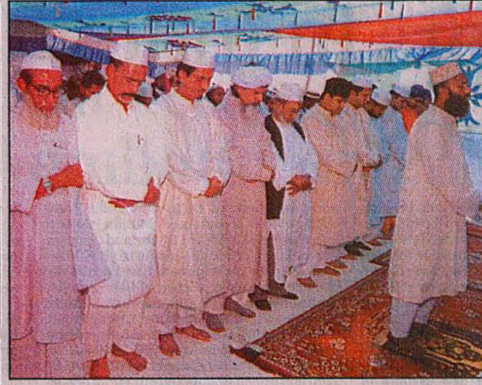
Devotees offer Eid prayers at Sureswar Darbar Sharif at Khilgaon Chowdhury Para in the city yesterday.