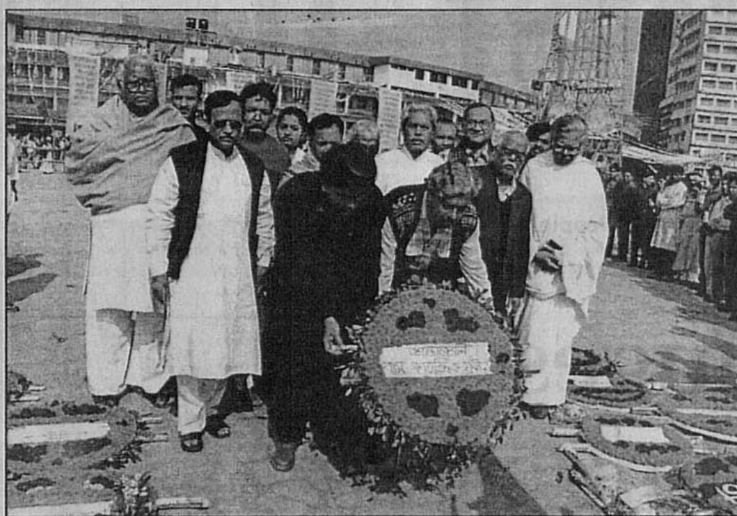
Leaders of Left Democratic Front place a wreath at the scene of bomb blast at Paltan Maidan in the city yesterday to pay homage to those killed in the explosion in 2001.

House # 33, Road # 9/A, Dhanmondi R/A (Elementary Section) House # 55/A, Road # 12/A, Dhanmondi R/A, (Junior Section) House # 31/A, Road # 8, Dhanmondi R/A, (Senior Section & Admission Office) Tel: 8110222, 0175-063243, 0189-270799.