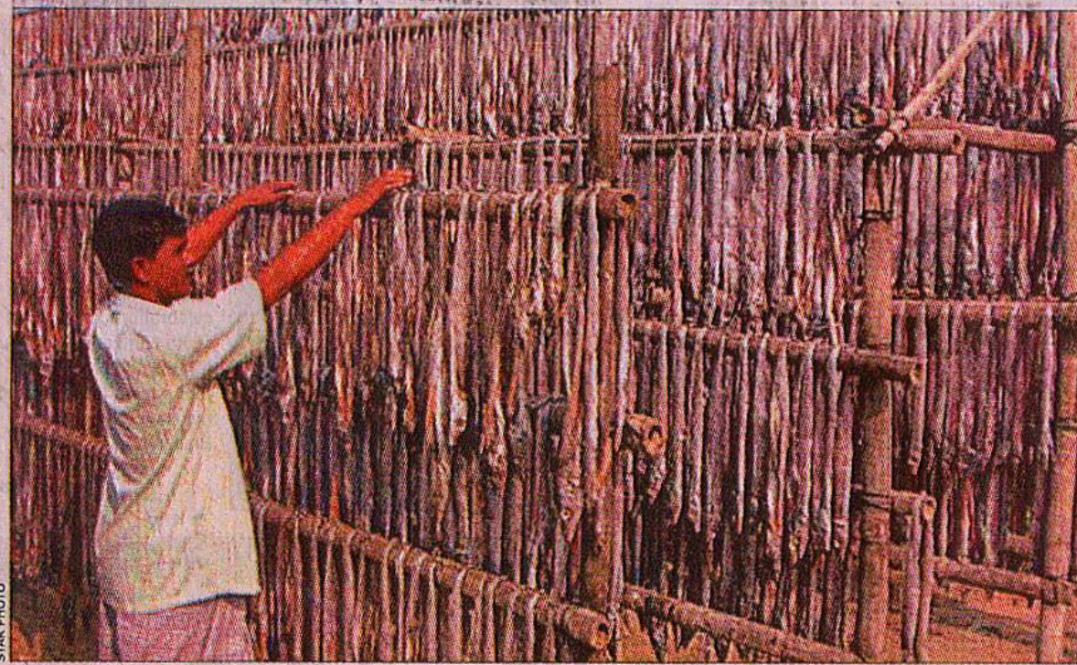
A trader is busy drying fish on the bank of river Karnaphuli.

"On the other hand, due to short-fall in supply, price of dry fish marked a rise. The pomfret that was sold at Tk 300 to 400 per kilogram one year back now sells at Tk 700 per kg. The latia dry fish is selling at over Tk 100 per kg. Acting principal officer of state owned Merchantile Marine Department Habibur Rahman said "whenever we get reports, we take action against the vessels responsible for dumping waste in our territorial water in the sea. But beyond our jurisdiction it is difficult to check or identify dumping of wastes from vessels at the outer sea," he said. Export Promotion Bureau Assistant Director Tofazzal Hossain said "our dry fish has a good demand at the export market. But it is not being exported in large scale due to various problems in shipment," he added.