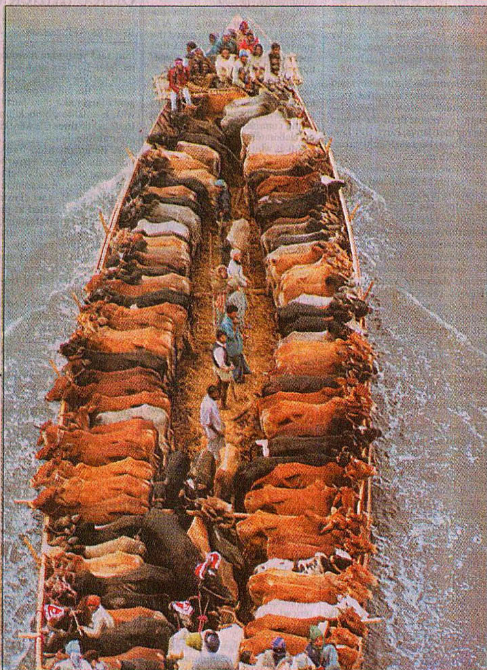
Cattle are being brought in by trawlers to the capital for the Eid market. Sixteen cattle markets have been allowed this year in the city.

The official said the area is suffering a series of aftershocks following the major undersea earthquake on December 26. The fourth tremor shook the city on January 14.