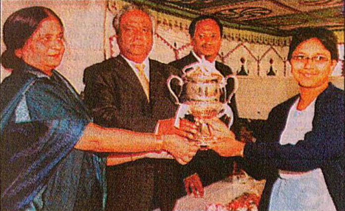
Education Minister Dr Osman Farruk gives away a trophy to a student as chief guest at the annual prize giving ceremony of Viqarunnisa Noon School and College in the city yesterday.