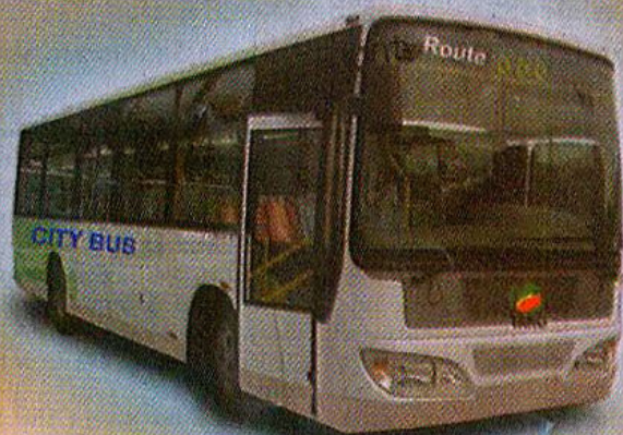
CNG City Bus