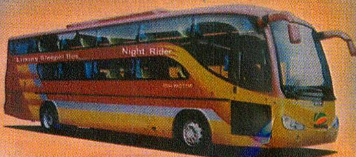
Luxury Sleeper Bus