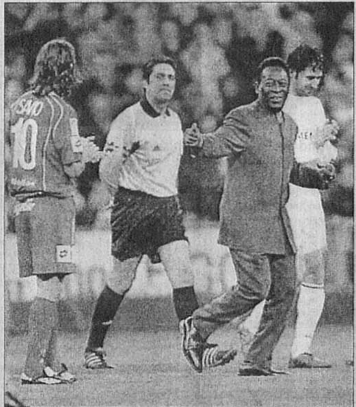
THE KING IN TOWN! Football legend Pele (C) walks on Santiago Bernabeu stadium turf while being applauded by Real Zaragoza's Brazilian Savio (L) and Real Madrid's captain Raul shortly before their Primera Liga match on January 16.

He played for Leeds United in England and Bari in Italy.