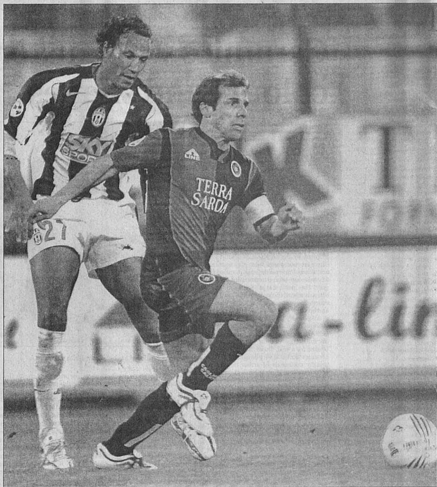
Cagliari's former Italy star Gianfranco Zola (R) tries to leave behind Juventus' Jonathan Zebina during match at St-Elia stadium in Cagliari on January 16.