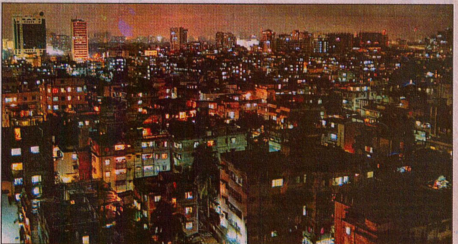
An aerial view of a lighted city at night.

He said Desa is trying to train the meter readers for the last two years to prevent them from committing corruption and irregularities.