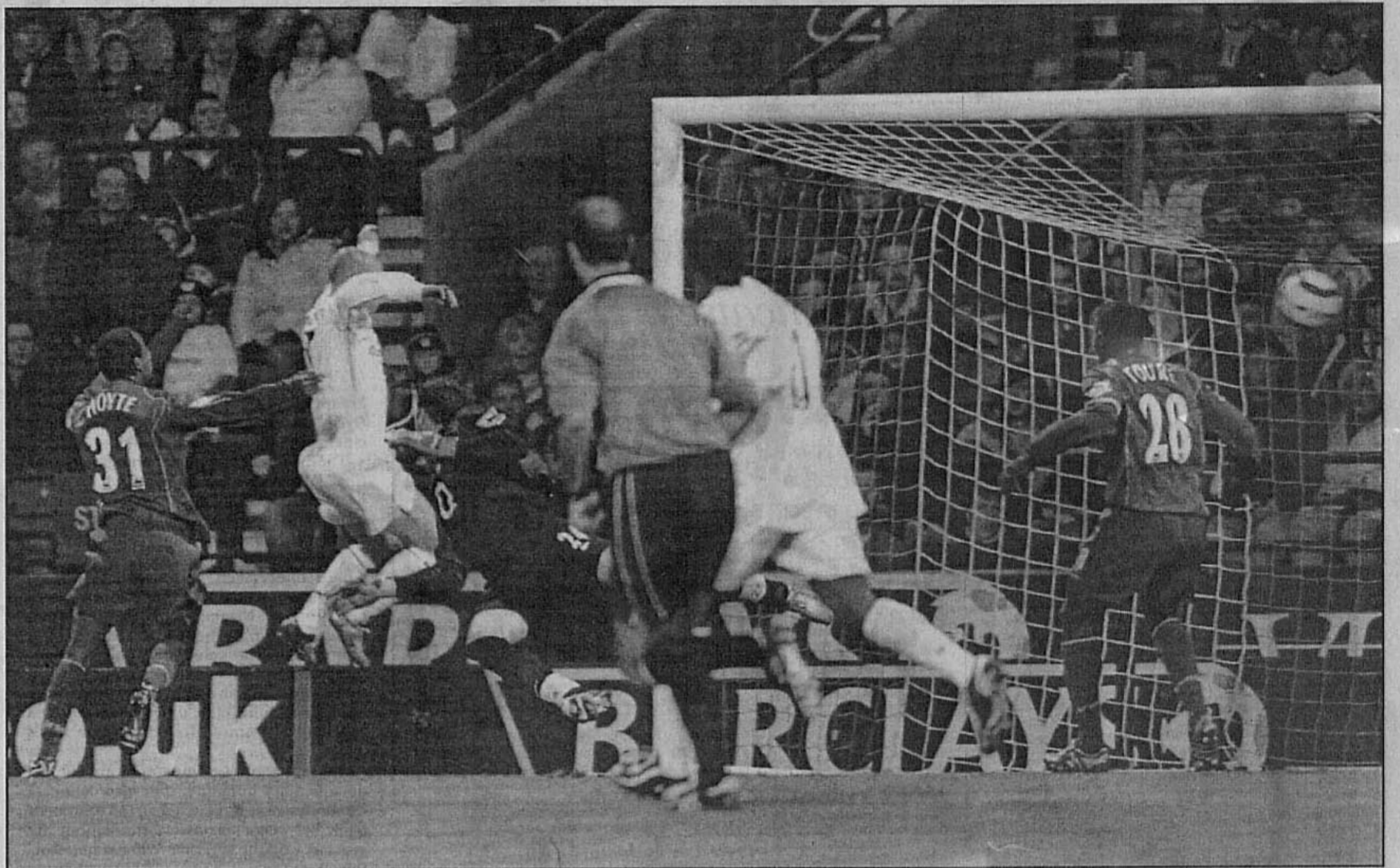
Bolton Wanderers's Stelios (2ndL) heads past Arsenal's goalkeeper Manuel Almunia to score at the Reebok Stadium in Bolton on January 15.