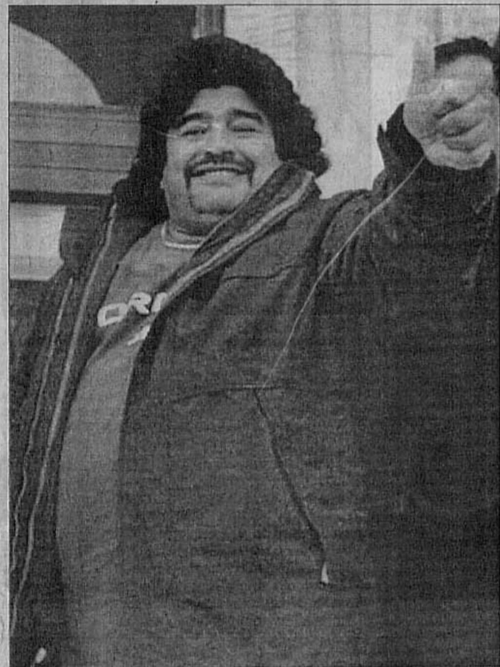
Argentine legend Diego Maradona waves at the entrance of an Athens hotel on January 13. Maradona is in Greece on a private visit.

Globomedia, one of the biggest producing firms of Spain, has the exclusive audio-visual rights of Maradona until 2010, in accordance with a contract signed with the former player. The firm said it has plans to make a biographical documentary on Maradona, jointly with producer Pentagrama, in 2006.