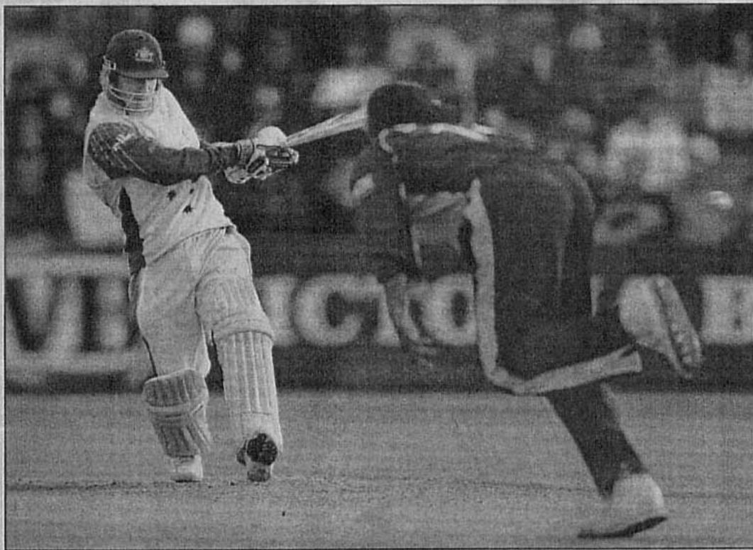
MAN-OF-THE-MATCH: Australia opener Michael Clarke pulls Pakistan fast bowler Shoaib Akhtar for four during their VB Series one-day international at Hobart yesterday.

He breached a condition of the International Cricket Council code of conduct forbidding criticism of match officials.