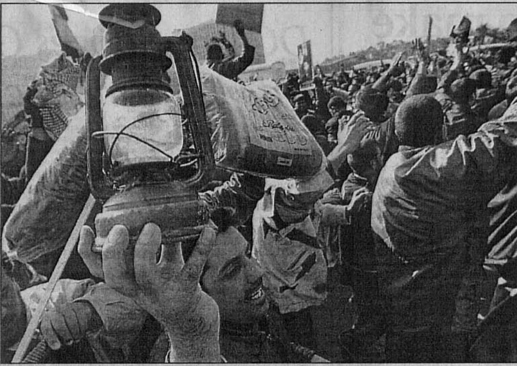
Iraqis, holding up a lantern and pictures of radical Shia Muslim leader Sheikh Moqtada Sadr, take part in a protest in front of the Oil Ministry in Baghdad yesterday against scarcity of fuel and its high prices.

Realitatea TV said she had given birth to twin girls, one of whom had died almost immediately. The surviving infant, which weighed 1.4 kilogram (three pounds), was in good health, the TV channel said.