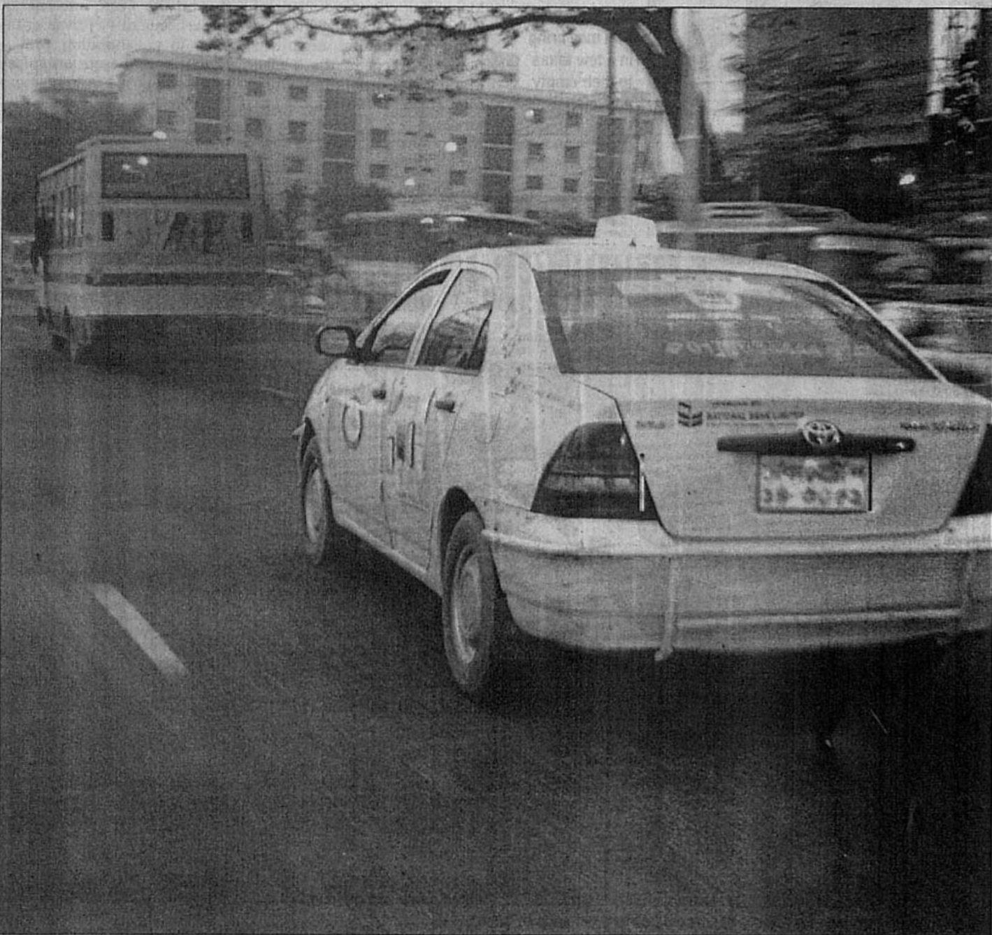
Travelling in taxi cabs may turn out to be safer once identity cards are introduced.