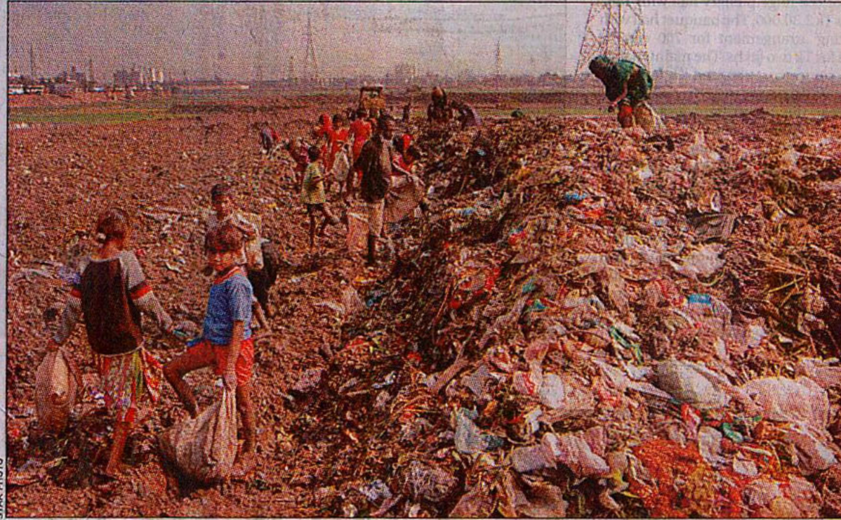
Street kids rake through the dumping grounds in Gabtoli in search of any waste particle that may bring in a few takas to their empty pockets.

aging open dumping of wastes. The DoE suggests application of CDM instead of increasing the numbers of dumping grounds in the land-scarce capital. At present, around 42 percent solid waste of the city is dumped at Matuail posing a serious threat to environment and public health. The open dumping cause air pollution in the area as well as contamination of groundwater. "If DCC implements the CDM project, the Matuail dumping ground will be capable of receiving the same amount of waste for the next 12 years without an expansion of the site," said Solaiman Haider, deputy director of DoE. DoE officials alleged the DCC is indifferent to modern waste management system for unknown reason. The unplanned disposal of solid waste in such a public place