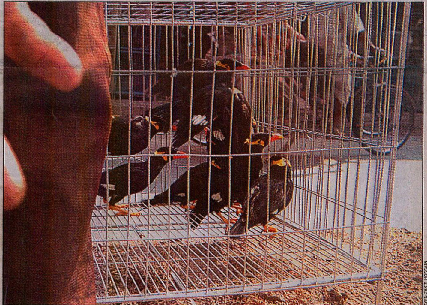
Endangered species of birds are openly on sale at a pet shop in the capital.