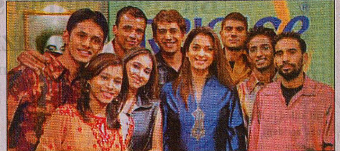
Actress Juhi Chawla (M) along with the contestants pose for a photograph.

One quick look would reveal that the winners of such talent show are simply scooped up by the private media companies, and within a short time transformed into idols, so that we stand in awe at their performances. And it is these artists who promote their culture internationally, invigorate the entertainment industry and keep the wheels of culture rolling. What is most attractive about the show is the transparency of the judges. Every single candidate is criticised or praised rightfully and is groomed to become a performer.