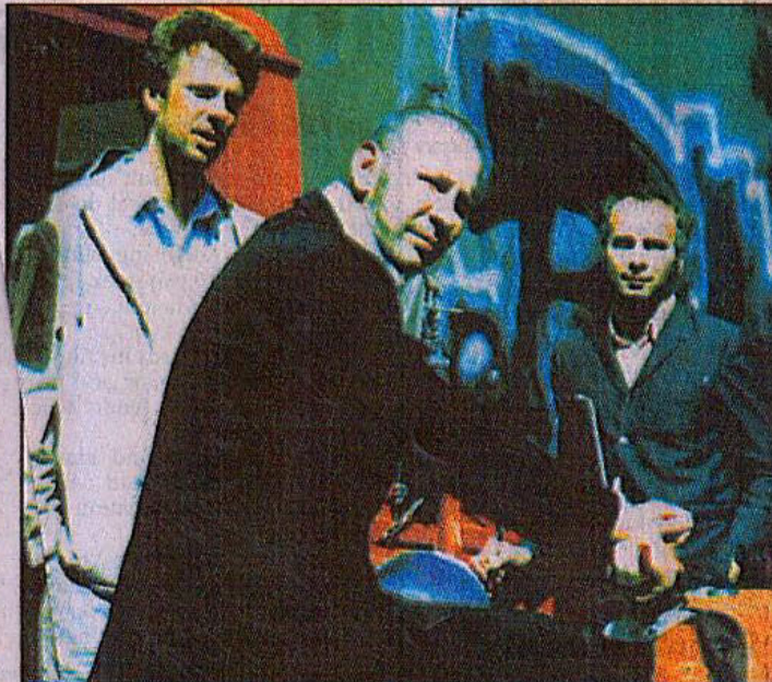
The jazz group Der Rote Bereich

The group has performed with success in a large number of international jazz festivals, such as Bell Atlantic Jazz Festival in New York,