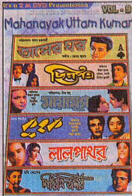
DVD collection for the viewers who love to watch the oldie goldies.

Evergreen films such as Harano Shur , Shobar Uparey , Shagarika , Prithibi Amarey Chay , Shilpi , Agni Parikkha , Bipasha , Tasher Ghar , Shonar Horin , Nayak , Devdas , Anthony Phiringi and Aparichito have been included in the