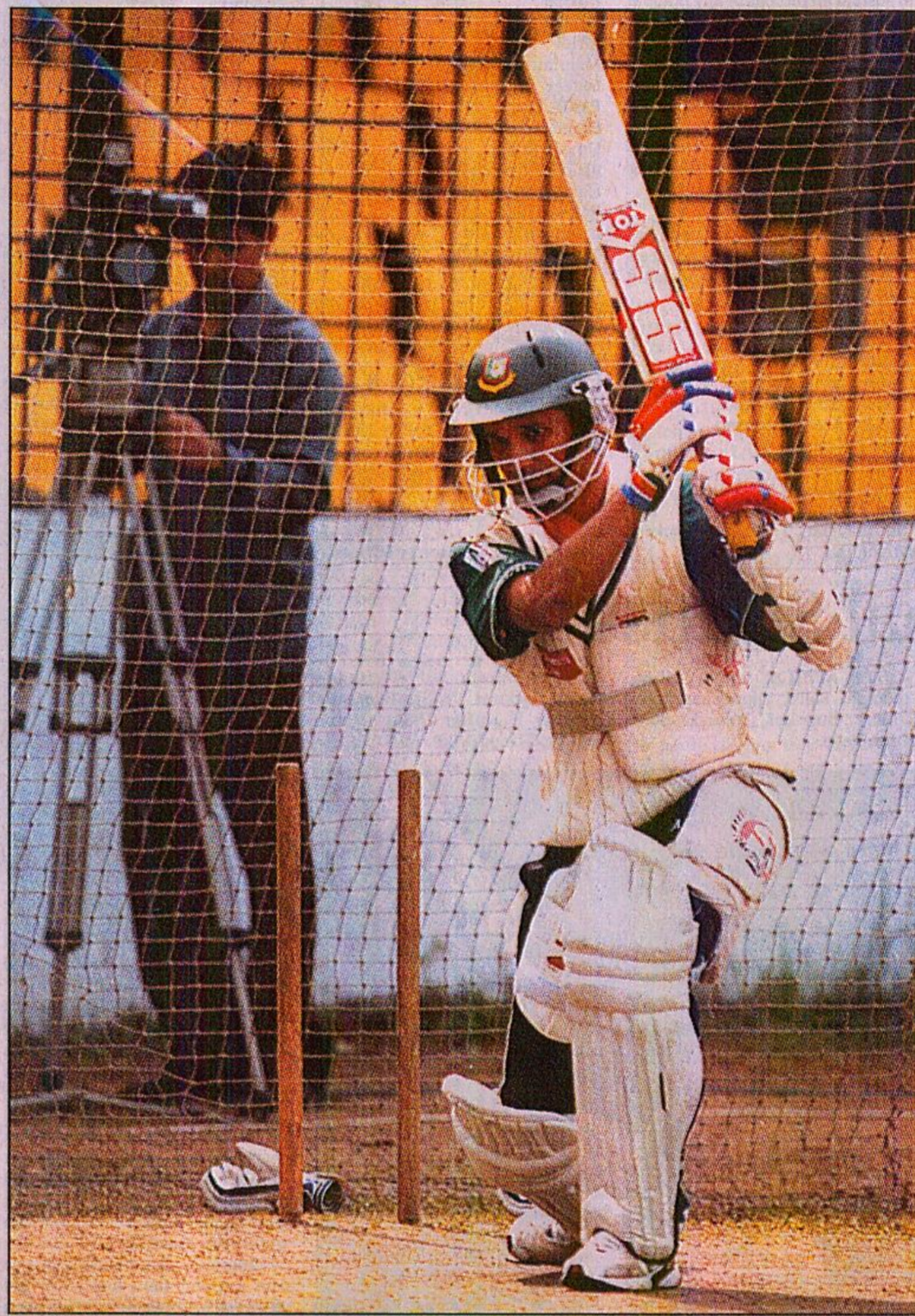
AT HIS BASHING BEST! Habibul Bashar, the Bangladesh captain drives during net practice yesterday at the Bangabandhu National Stadium.