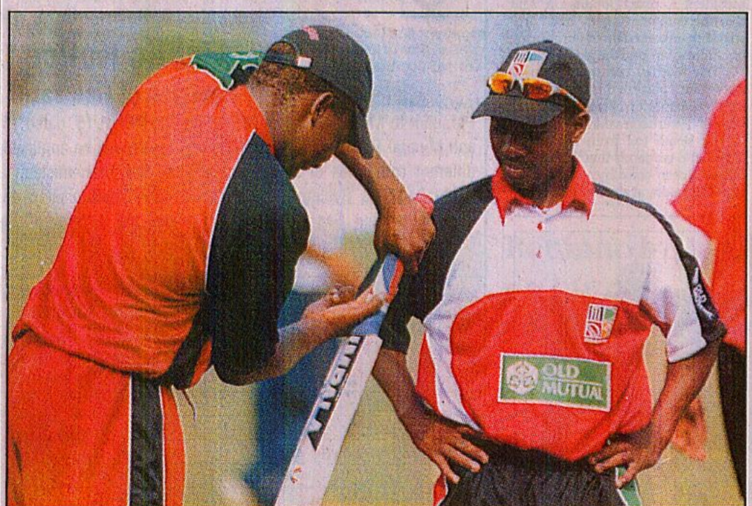
A teammate shows his defence to Zimbabwe captain Tatenda Taibu (R) during yesterday's practice session at the Bangabandhu National Stadium.