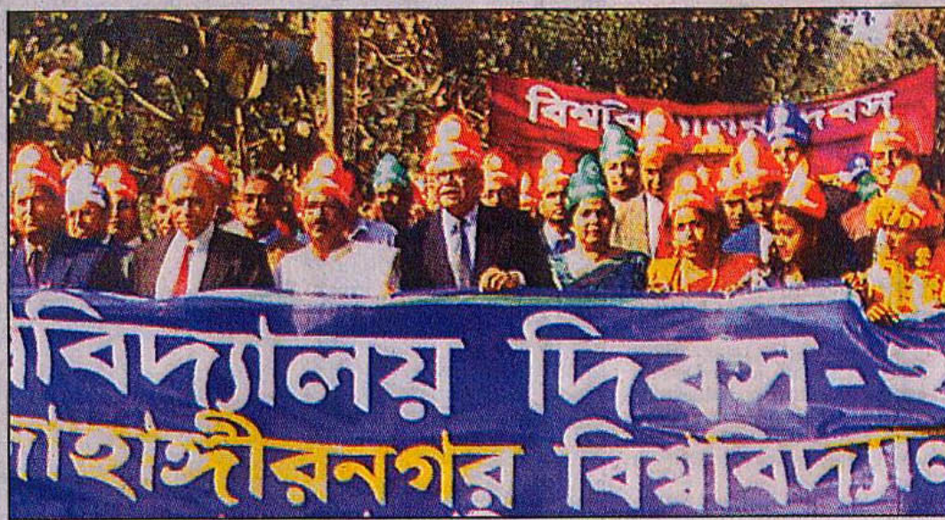
Teachers, students and staffs of Jahangirnagar University took out a colourful procession on the campus yesterday to celebrate the University Day.

The IRC will remain closed for its renovation work and on the occasion of Eid-ul-Azha. It will reopen on January 24.