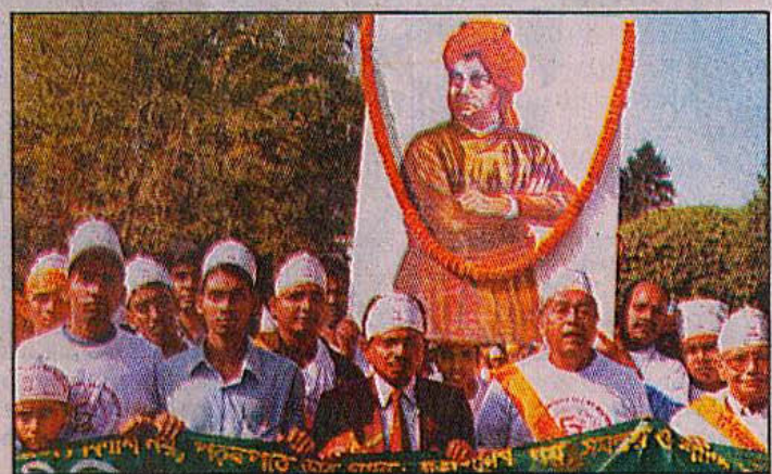
Swami Vivekananda Uddipan Committee brought out a colourful procession in the city yesterday marking the 142nd birth anniversary of Swami Vivekananda.

Contributions can be sent to the Savings Account No.-02099565, Islami Bank Bangladesh Ltd, Shamoly Branch, Dhaka. Interested persons can also contact his family at mobile No. 0189900625.