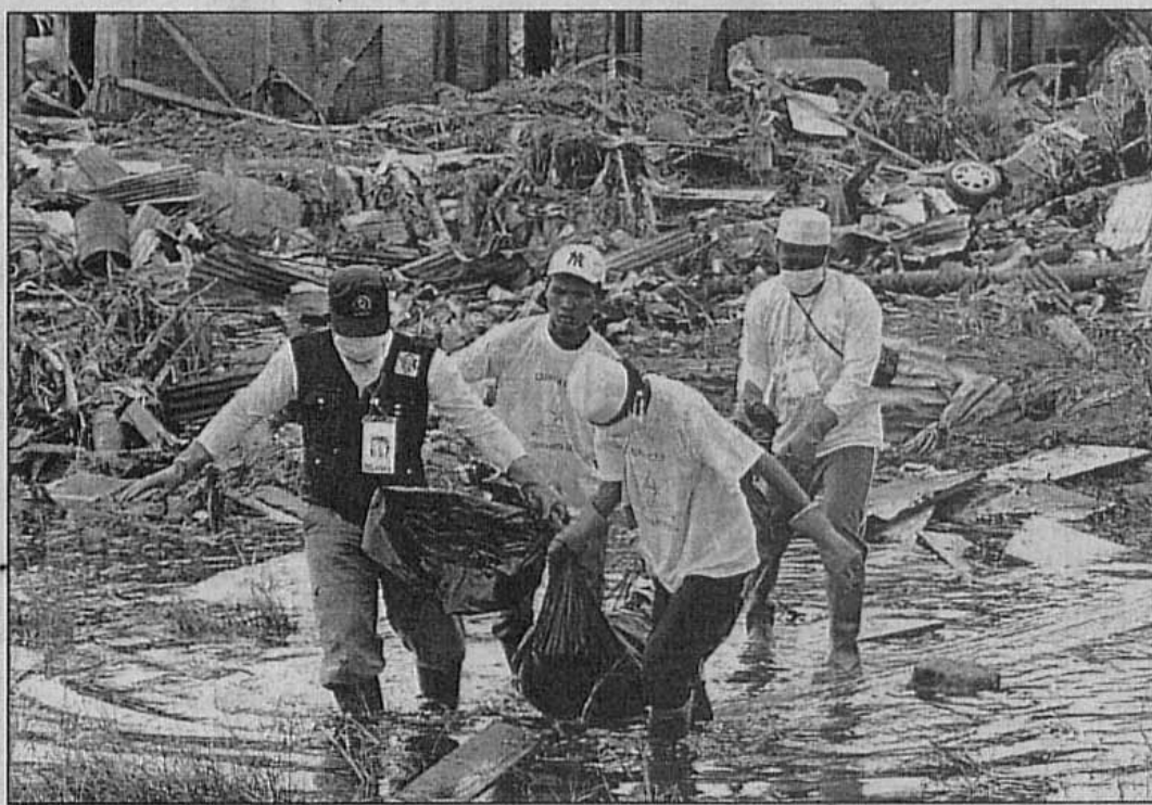
Indonesian volunteers carry a dead body from in debris, in Banda Aceh yesterday. Indonesia, hardest-hit by the December 26 walls of water, has now reported 106,523 deaths, with 12,047 people missing, an increase of more than 2,000, the social affairs ministry said.

Senior officials said foreign journalists would also be confined to major towns in the province, closing a post-disaster window of press freedom in the region which was locked down almost two years ago during a military offensive.