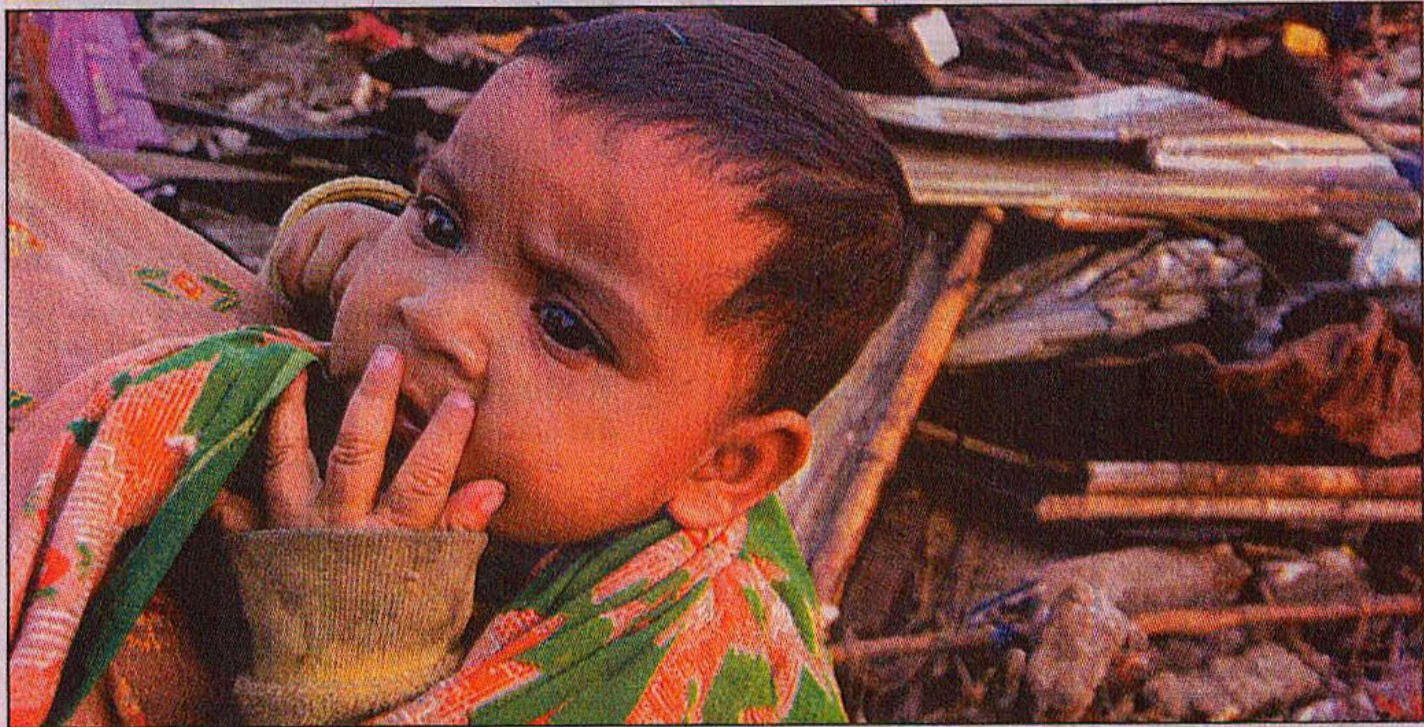
UPROOTED ONCE AGAIN... A child gazes at a future unknown to him and his parents as they lost their home when Rajdhani Unnayan Karttripakkha (Rajuk) razed down a few hundred shanties at Banani Amtoll slum in the capital yesterday.