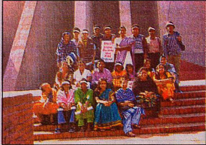
Organisers and the victims of acid-violence at the foot of the National Memorial