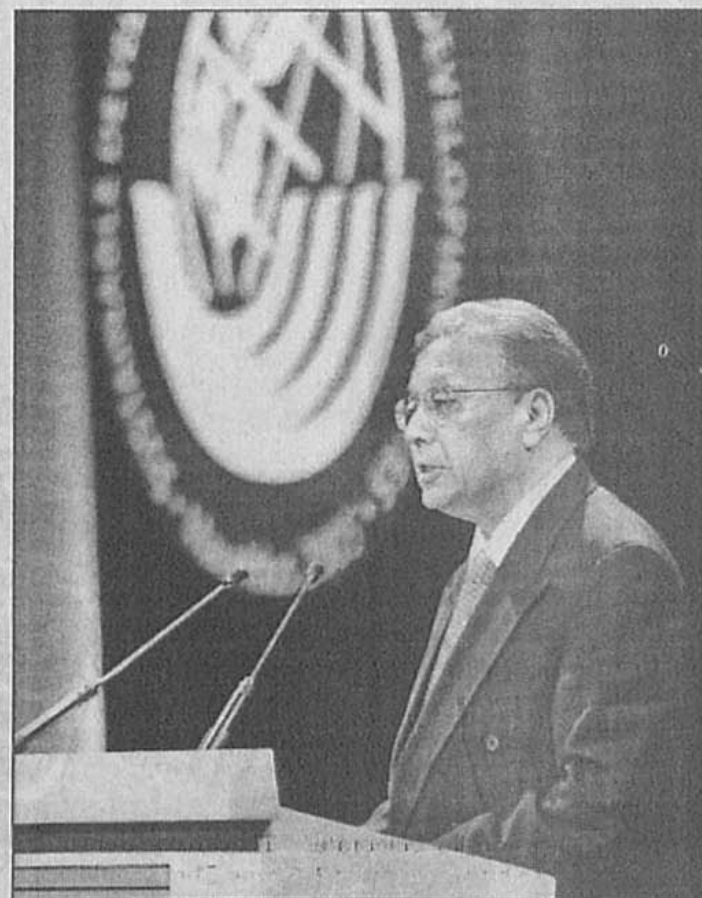
Anwarul K. Chowdhury, United Nations under secretary general and top representative, reads his opening remarks to the delegates of the International UN summit on the Developing Small Island States yesterday in Port Louis. The summit opened with a call to set up an early warning system to prevent a repeat of the tsunami disaster in Asia that left more than 156,000 dead.

The tsunami unleashed by an earthquake off the Indonesian island of Sumatra has underscored the need to help islands cope with more powerful and frequent hurricanes, cyclones and storms that many experts see as the effects of climate change.