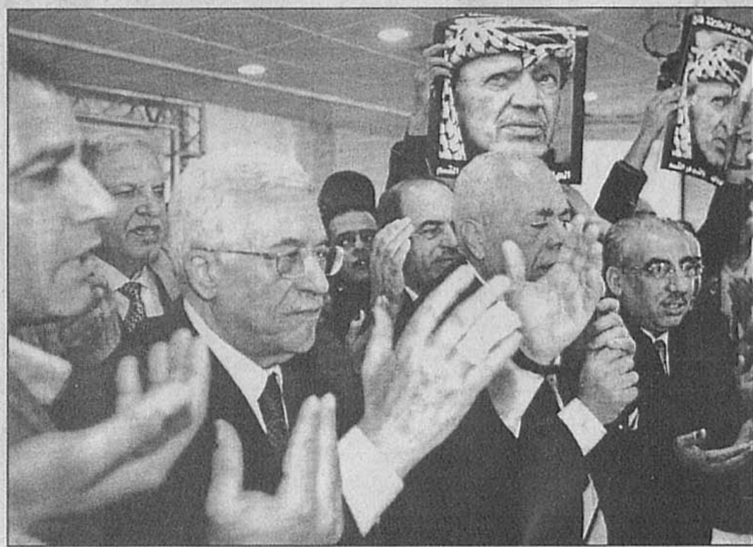
Palestinian president-elect Mahmud Abbas and his advisers offer Munajat (prayers) seeking divine blessings for late Palestinian leader Yasser Arafat during the celebration of his victory in Ramallah Sunday. PLO chairman Mahmud Abbas officially declared elected president yesterday.