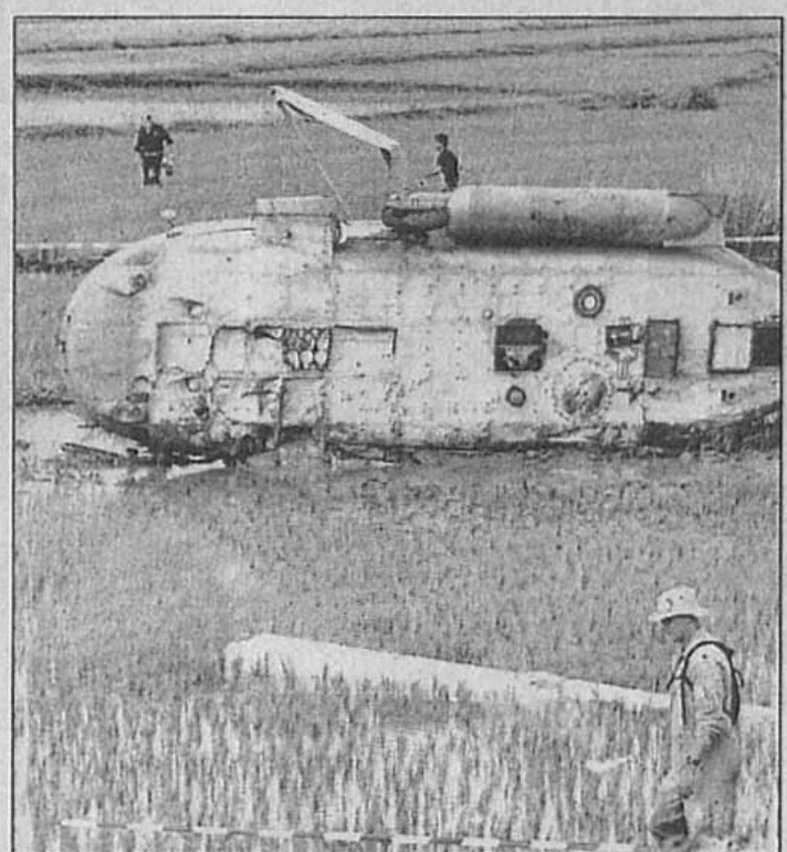
A US military personnel walks past a US Navy Seahawk helicopter which crashed on a rice field near a military air base in Banda Aceh yesterday. A US navy Seahawk helicopter bringing aid to victims of the tsunami disaster on Indonesia's Sumatra island crashed yesterday leaving four people slightly injured, aid officials said.