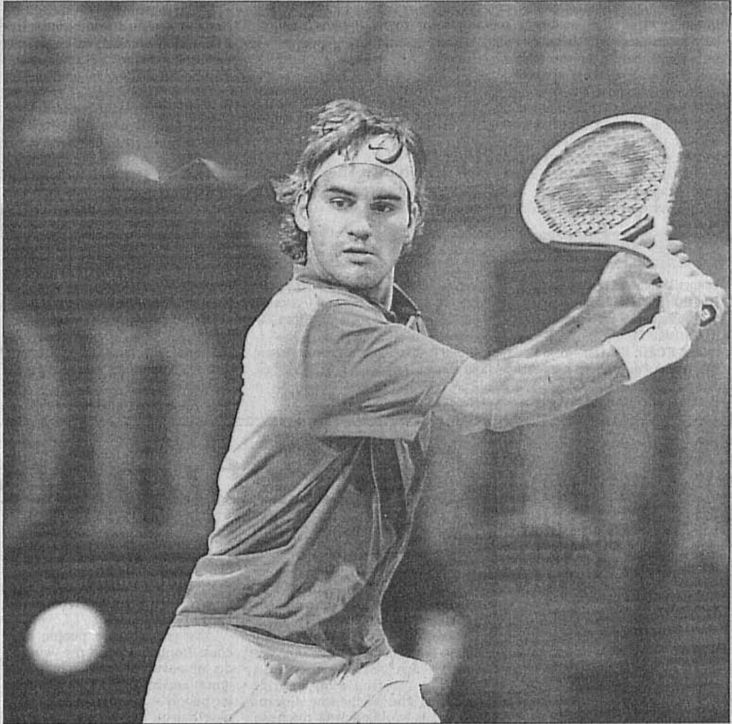
World No 1 tennis player Roger Federer of Switzerland hits a backhand against Ivan Ljubicic of Croatia at the Qatar Open final in Doha on Saturday.

Federer was sometimes forced to scuttle quickly to contain the bombshells from Ljubicic, who had won three of the previous six encounters including the last one 15 months ago in the Wimbledon champion's home city of Basle. But Federer was also constructing points, as usual, in a wide variety of ways. After Ljubicic served a double fault disastrously to concede a break at the start of the second set, the world number one increased the frequency of his net attacks. He concluded the next game with a fierce volley and finished the match with a deft approach facilitating an exquisitely angled forehand volley winner - moments which would have pleased his new coach Tony Roche, who apparently will be trying to develop this aspect of Federer's game further. "At the moment I think Federer is playing better than Sampras did," said Ljubicic. "It's just that Pete went on for seven years. We will have to see through the years how Roger copes." Federer next travels to Kooyong to play an exhibition tournament before beginning the defence of the Australian Open in nine days time.