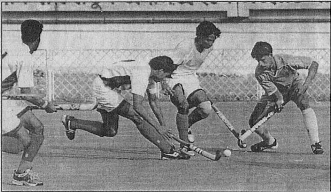
Action from yesterday's Green Delta Premier Division Hockey League encounter between Usha and Abahani at the Maulana Bhasani National Stadium.