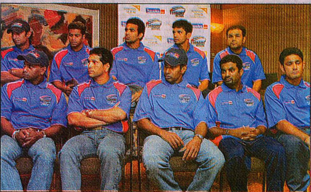
PLAYING FOR A NOBLE CAUSE: Asian cricket superstars listen to speeches at a function in Melbourne yesterday. They take on the Rest of the World side in a charity match here today.