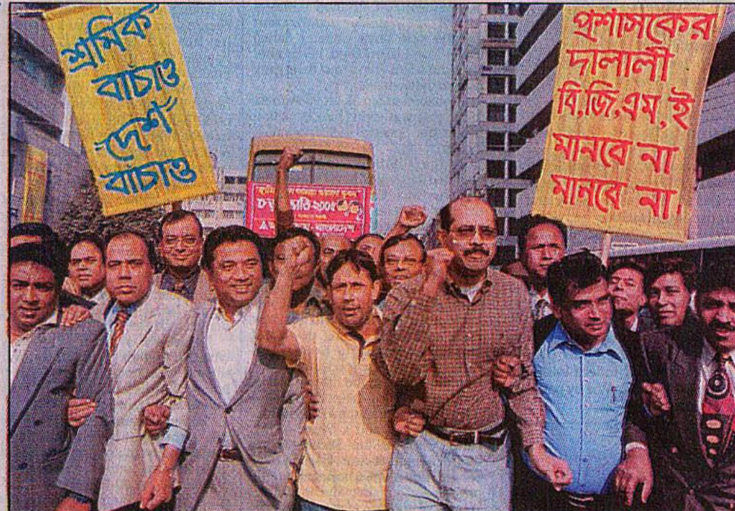
Bangladesh Garment Manufacturers and Exporters Association (BGMEA) leaders bring out a procession in the capital yesterday to protest the appointment of an administrator at the association.