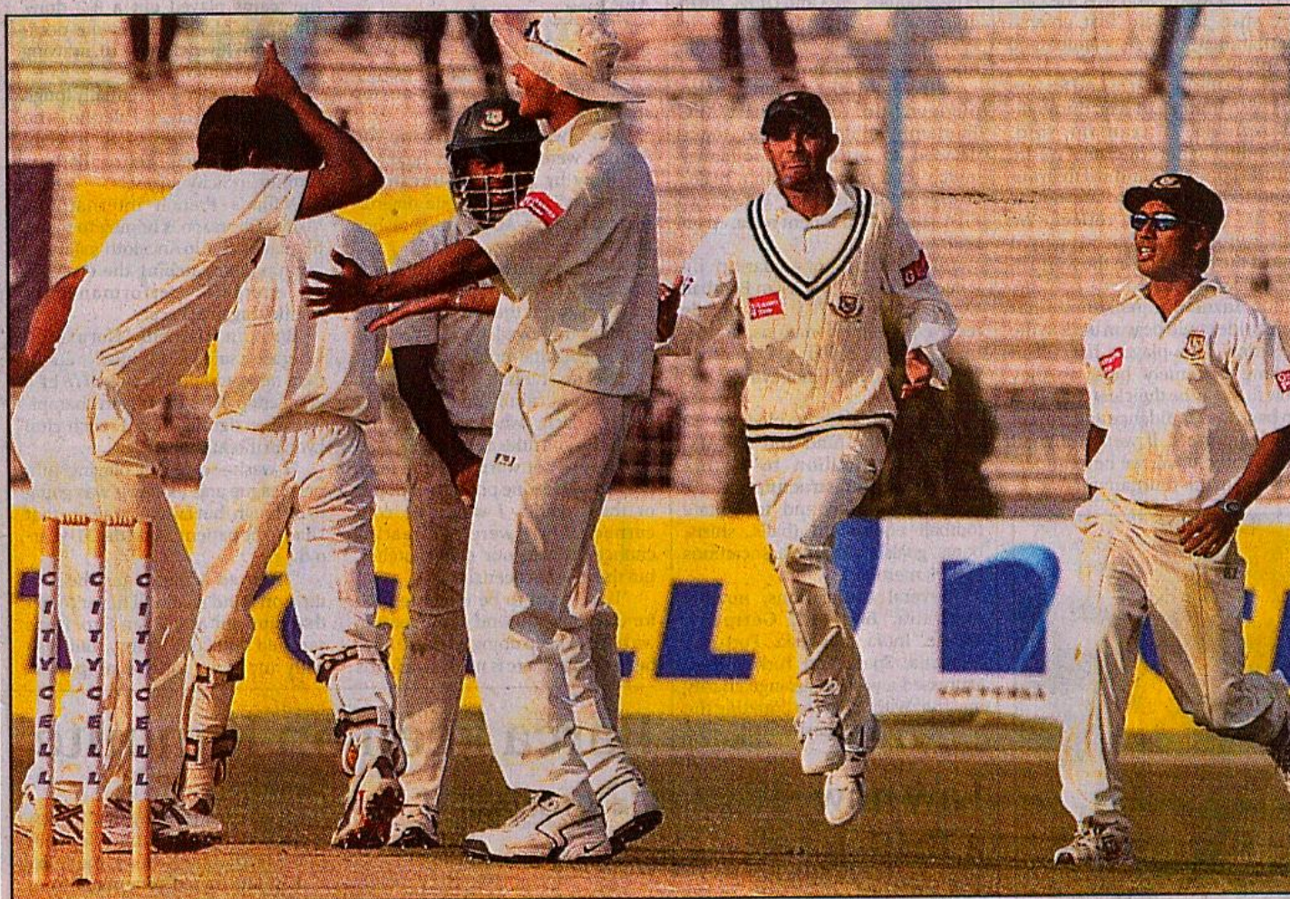
DANCING RAFIQUE STYLE: Bangladesh spinner Mohammad Rafique (L) celebrates the dismissal of Zimbabwe captain Tatenda Taibu (not in picture) with teammates on the third day of the first Test at the MA Aziz Stadium in Chittagong yesterday.