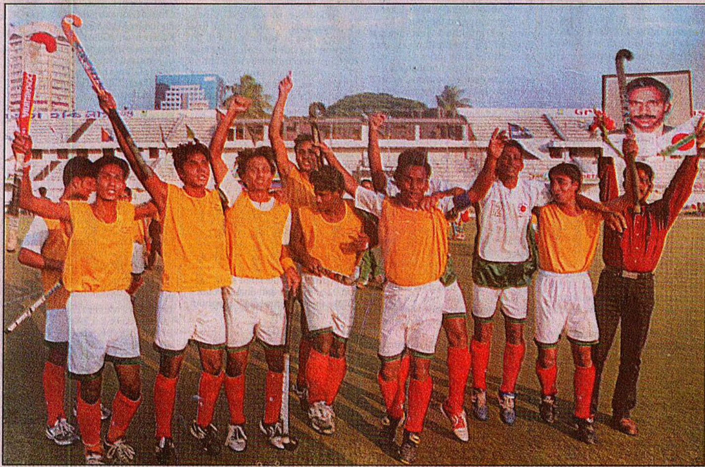
AN ERA BEGINS: Players of Usha Kriya Chakra, who still have a match in hand, celebrate lifting the title of the Green Delta Premier Division Hockey League after beating Mohammedan Sporting Club at the Maulana Bhasani National Stadium yesterday.