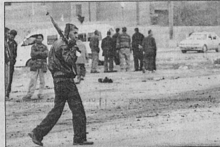
An armed Iraqi officer surveys the scene following a car bomb yesterday in Baghdad.

AFP, Baghdad US embassy officials in Baghdad want more money for the Iraqi police, national guard and army, warning the deteriorating security situation is outpacing their efforts to strengthen the country's fledgling security forces. The funding could come either from a new 75-80 billion dollar supplemental budget to be submitted to Congress this February, or by diverting more funds from Washington's 18.4 billion dollar reconstruction package for Iraq. "I don't know if we have to put more from the 18.4 (billion) in. I guess if we have to, we will," said an US embassy official on condition of anonymity. "We already have taken a lot of money out from some of the bigger long range projects. To take out more is going to be very painful but we know we need more additional support." Last summer, the US embassy performed a top-to-bottom review of spending priorities in its 18.4 billion dollar aid package and recommended diverting 1.8 billion dollars to security from electricity and water projects.