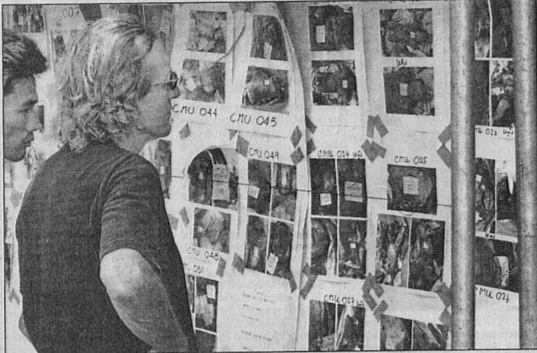
A foreigner looks at the pictures of the dead bodies at a relief camp in Khao Lak beach yesterday.

Of the missing, 2,113 including 336 foreigners were listed in Phang Nga, 1,669 in Krabi including 579 foreigners, 700 in Phuket including 161 foreigners, 16 Thais in Ranong and one Thai in Trang.