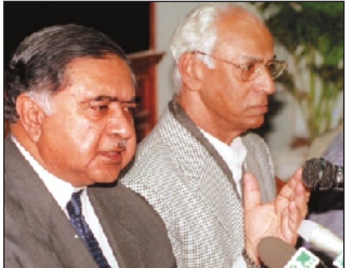
Jatiya Oikya Mancha Convenor Dr Kamal Hossain speaks at a press conference at the National Press Club in the city yesterday.