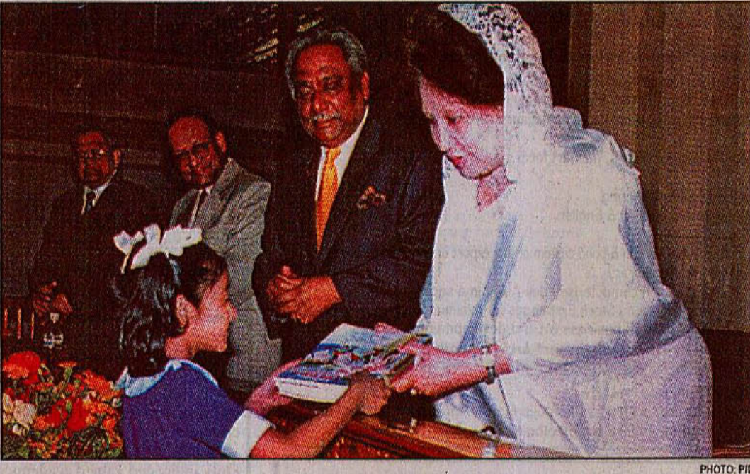
Prime Minister Khaleda Zia hands over textbooks to a primary school student yesterday at her office launching the nationwide textbook distribution.