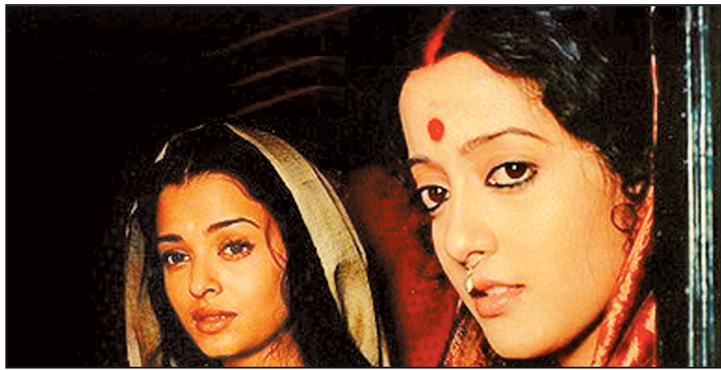
Aishwarya Rai and Raima Sen in Chokher Bali

Another milestone in the year was the most hyped Bangla film Chokher Bali , a celebrated literary work of Rabindranath Tagore. Starring Aishwarya Rai, acclaimed filmmaker Rituparno Ghosh from West Bengal, India, brought the story on celluloid. Shot at Ramnagar, near the holy town of