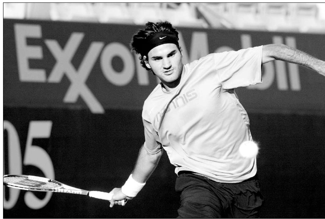
Swiss tennis superstar Roger Federer goes for a return during a training session for the Qatar Open in Doha on Thursday.