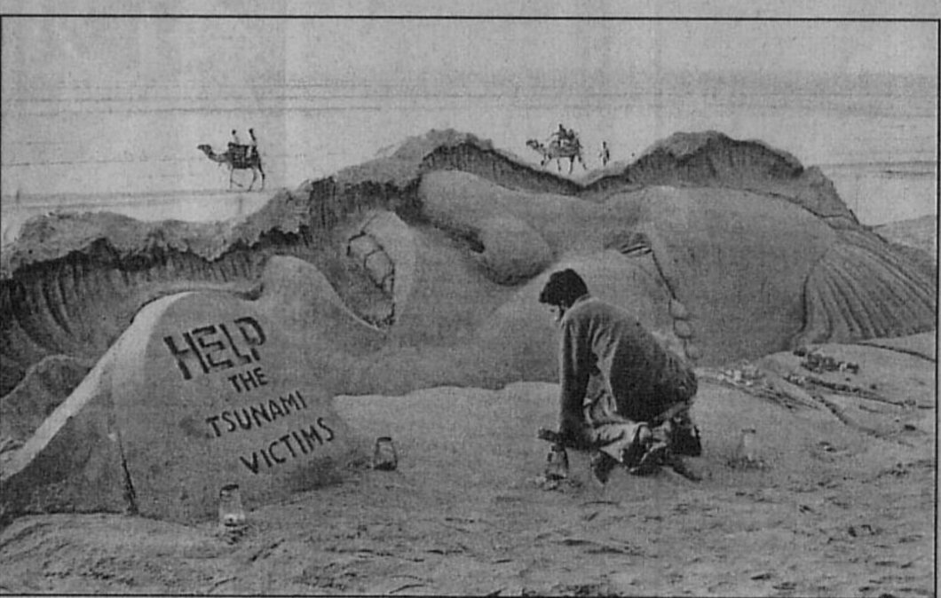
Indian sand artist Sudarshan Patnaik completes a sculpture in memory of the victims of the tsunami disaster in Puri some 100 Kms south of the capital of the Indian state of Orissa, Bhubaneswar yesterday.

"All three slain militants were Pakistani nationals," the spokesman said, adding they were members of Lashkar-e-Taiba, which wants Kashmir to be joined with Pakistan.