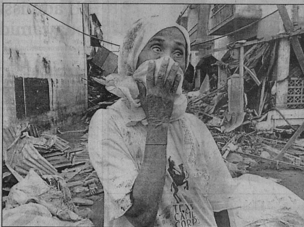
An elderly Indonesian woman stands in front of her damaged house six days after huge waves caused by a powerful earthquake took all from her, in Banda Aceh yesterday.

"It is true that this not aimed at being a full international conference but a more limited one, as this is an initiative, a response or a reaction from the community in the region," he said.