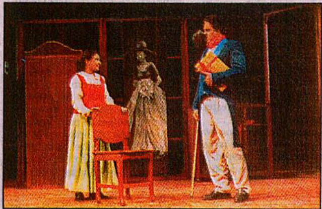
A sequence from the play Projapati