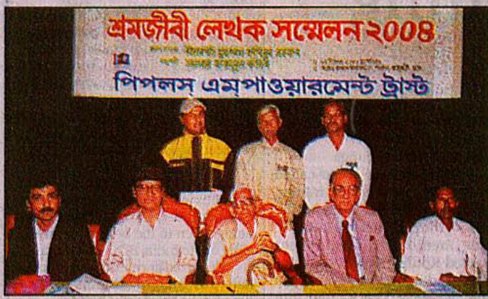
The winners (standing) with the organisers and members of the jury board