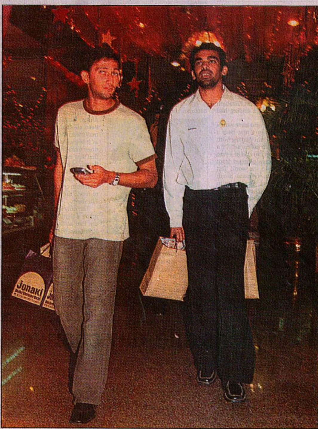
LET'S GO SHOPPING INSTEAD: Indian pacers Ajit Agarkar (L) and Zaheer Khan return to the Sonargaon Hotel, where the team is staying during their tour of Bangladesh, after doing some Christmas shopping yesterday.

It was the third defeat for Wari in six rounds.