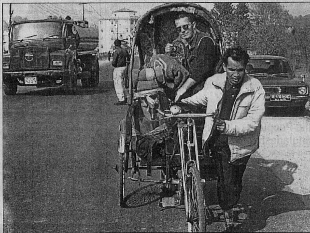
A Nepalese rickshaw rider pushes his tourist passenger along a road leading to the airport in Kathmandu yesterday on the second day of general strike called by Maoist rebels. A strike called by a pro-Maoist group in Nepal closed schools, shops and slowed transport in the Kathmandu valley, witnesses said.

The Supreme Court upheld that ruling in 2002.