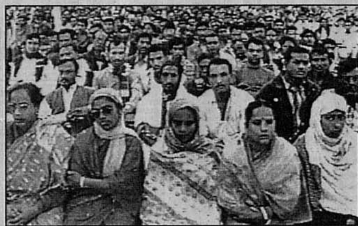
A partial view of crowd at the rally at Ratanpur where the union was declared fully sanitised.

Police said they could not arrest any body as the accused are absconding.