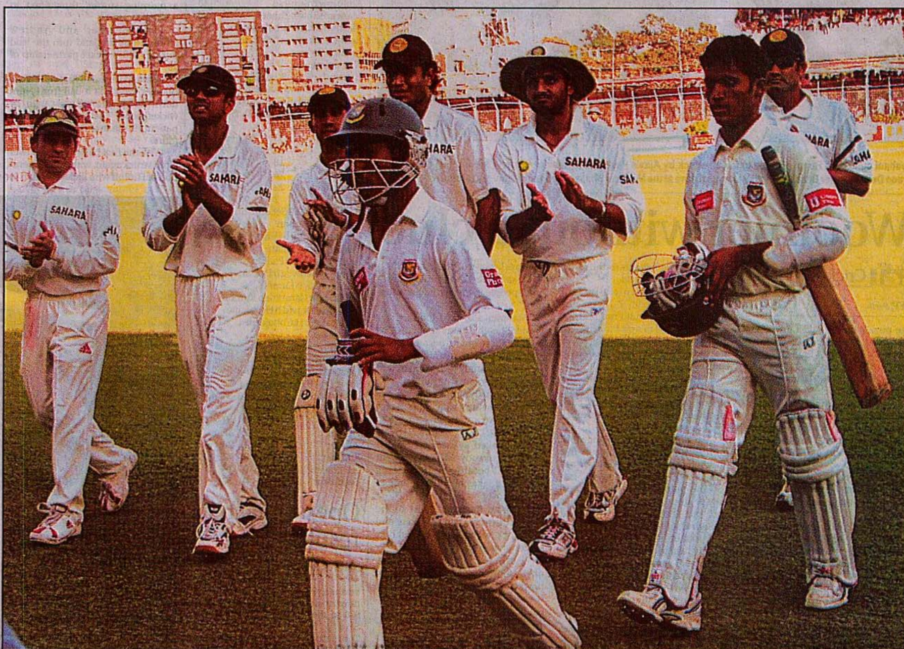
WHEN THE LITTLE MAN LEADS THE WAY, OTHERS CAN ONLY FOLLOW: Bangladesh's star of the day Mohammad Ashraful being applauded by Indian players as he leads them off the field after the Tigers' first innings had ended in Chittagong yesterday.