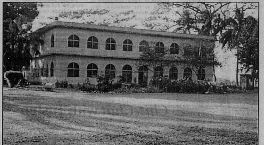
A view of Shilpacharya Zainul Abedin Sangrahashala (museum) in Mymensingh town.