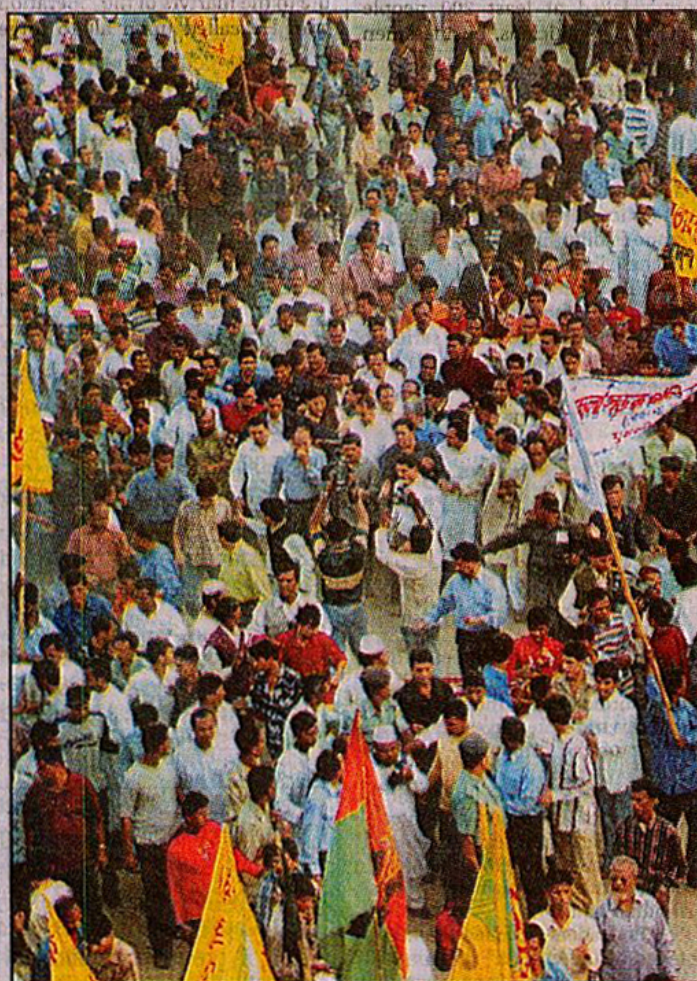
BNP and its front organisations took out a colourful procession in the city yesterday as part of the Victory Day celebration programmes.