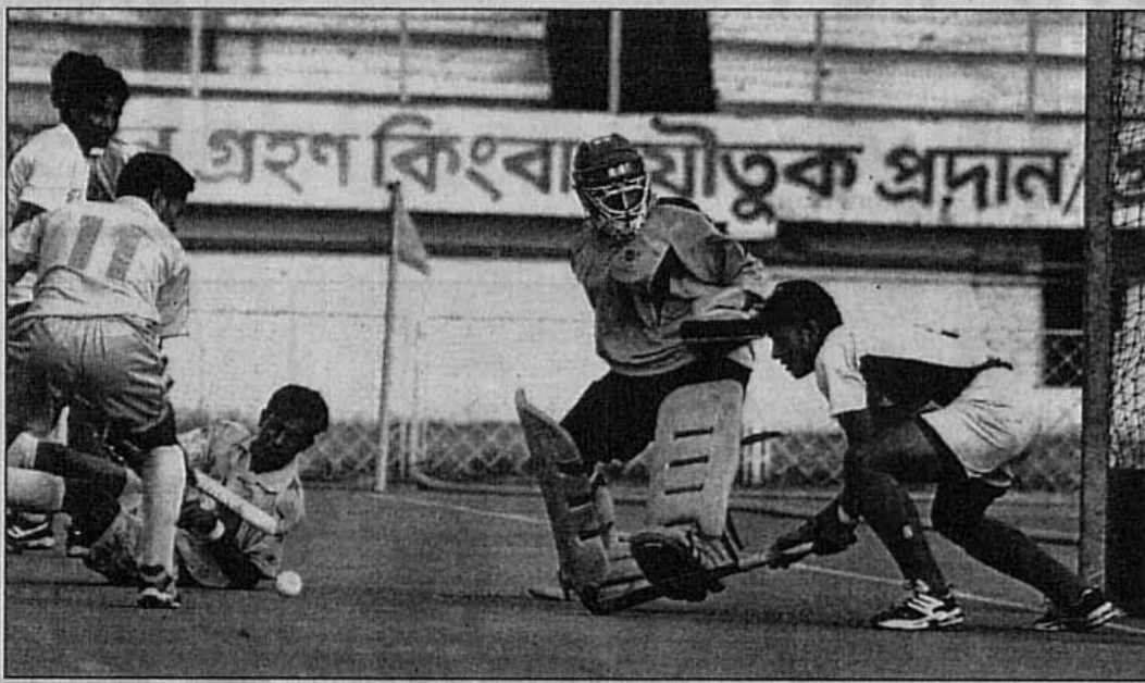
A goalmouth action during the Abahani-Usha clash of the Green Delta Premier Division Hockey League at the Maulana Bhasani National Stadium yesterday.

CRYPTOQUIP P IKOY CDM D UPKPCJYE EYZYDECPKN ZPC CYEUIK P NGYCC ZY TEDOJPOYC MZDJZY TEYDOZYC Yesterday's Cryptoquip: IF A PHYSICIST CAN'T COMPLETE HIS CHORES, PERHAPS HE HAS TOO MANY IONS IN THE FIRE. Today's Cryptoquip Clue: O equals C