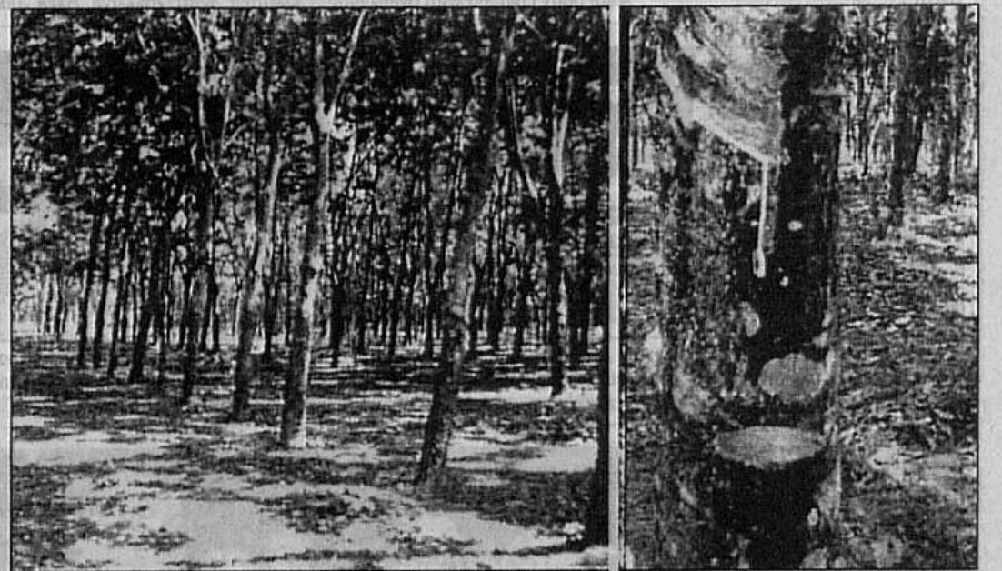
A partial view of Idris Ali's rubber garden (left) and extraction of white liquid rubber

If BFIDC cultivates rubber in 20,000 acres of fallow land in Sherpur, the country's demand can be met, officials said.