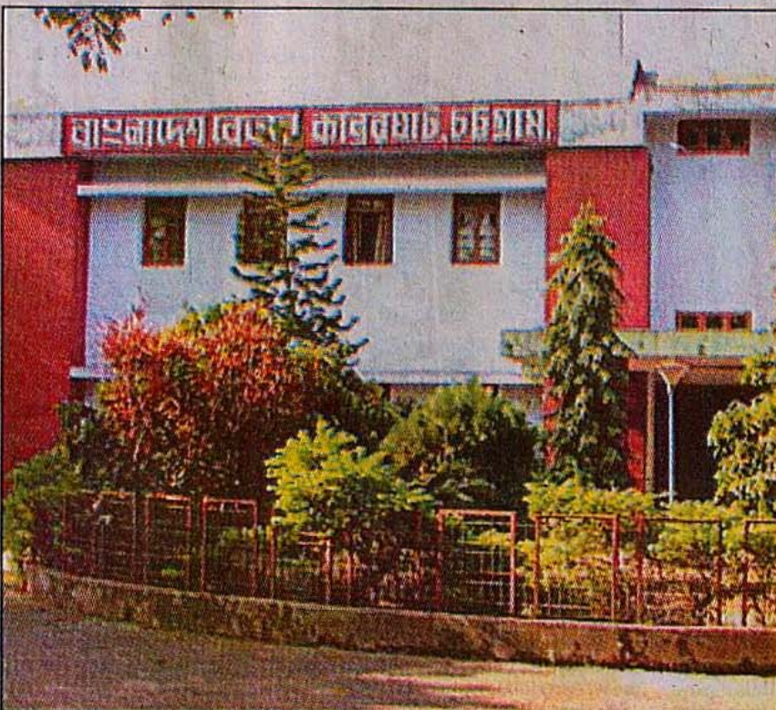
Bangladesh Betar Kalurghat centre (left) from where the proclamation of independence of Bangladesh was aired on March 26 night and the proposed site for heritage park Mini Bangladesh (right). The trees will be felled to develop the park.

Concord will hand over the park to the Ministry of Liberation War Affairs after completion of the work, he said. Then the ministry will either lease it out to private sector or deal itself, sources said.