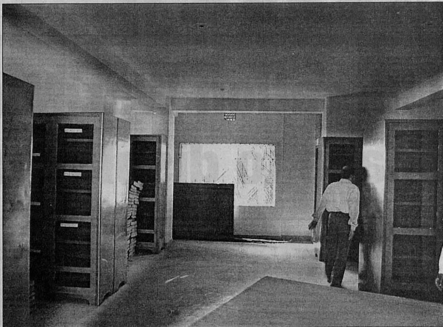
The extension of the BFA library which is underway will have the capacity to accommodate at least 10 readers at a time.